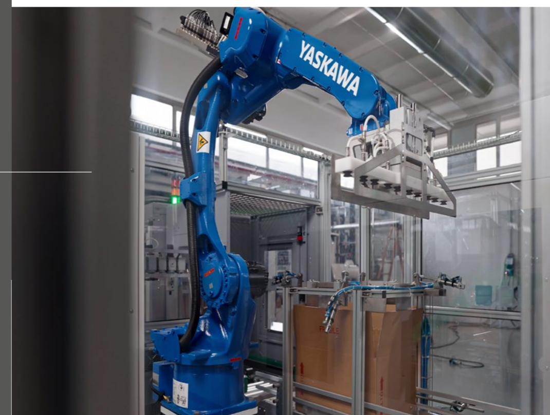
The units are prepared for shipment, in an automated way, by preparing single cartons or complete pallets. Each carton is identified by a label with a unique code containing all the production specifications.